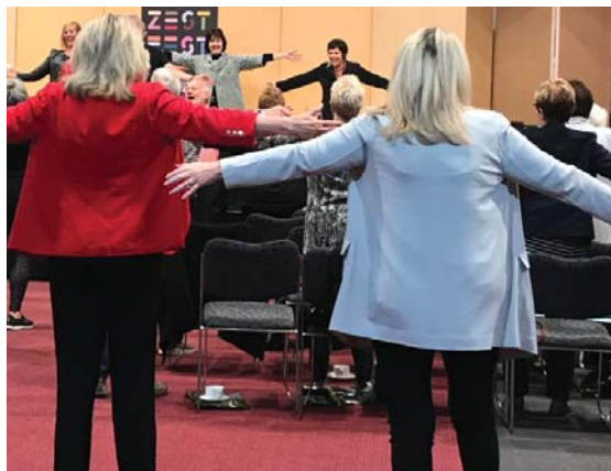
"Made us aware that we could do it!"