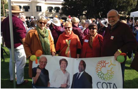
"I am very appreciative of the support offered."