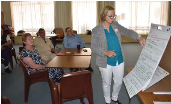
"I found the session interesting and helpful"