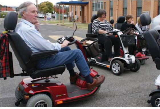
"I hadn't realised that I might be nearing the point of not driving, so I was happy to learn about other ways of getting around."