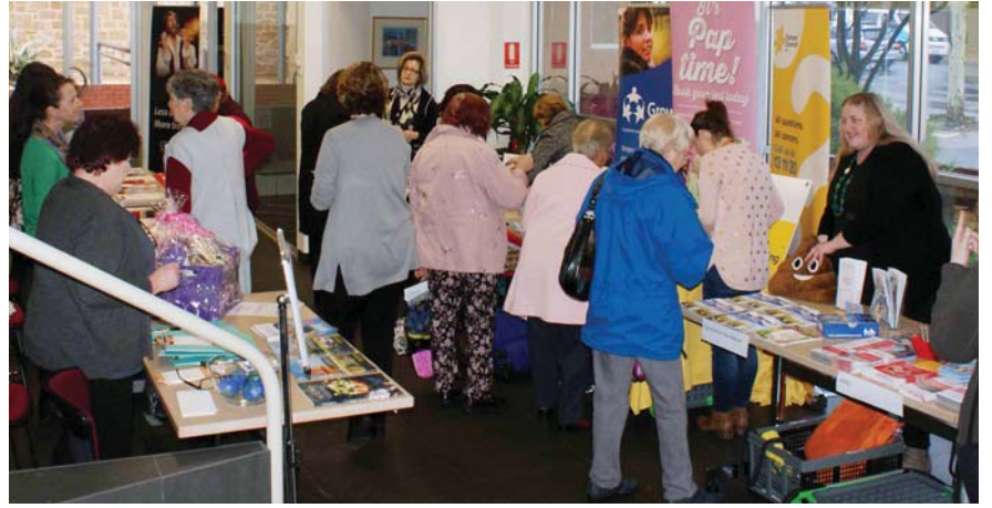
"Raised many questions and all were answered."