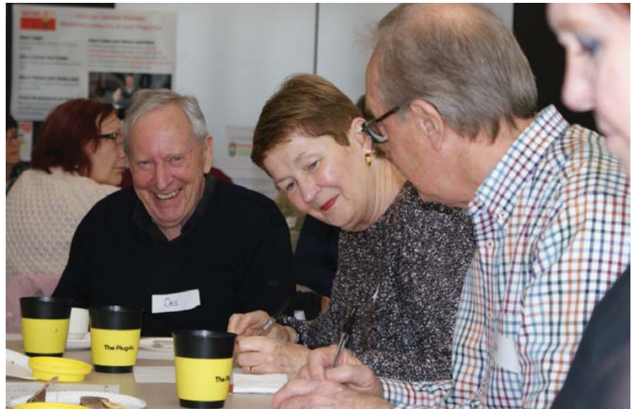
"Everything was very clearly explained"